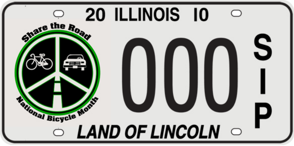
Plate Background Color is Silver - Image is Black and Green