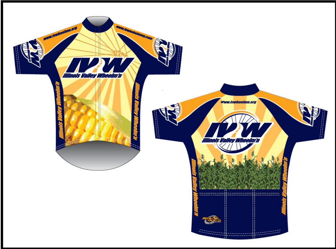
POSSIBLE NEW DESIGNS - SEE RELATED ARTICLES ON PAGE'S 3 & 5