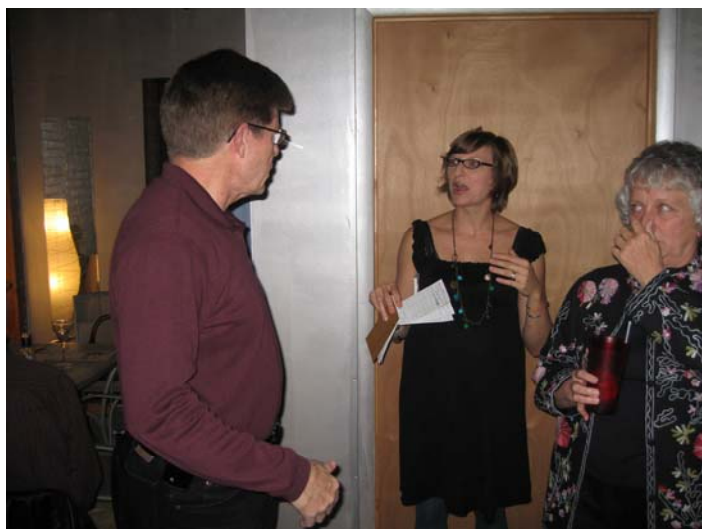
I think by the look on the girls' faces, we may all know what happened here!