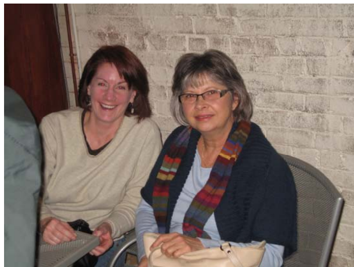
Gurls jus wanna have fuuuuun! I think I know who the DD is going to be.

Not a single seat in the house was left empty.