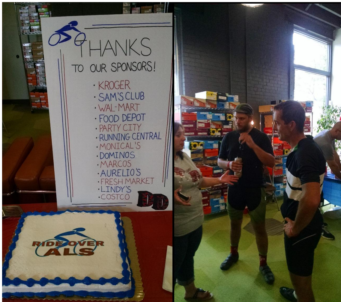
Welcome party at Running Central.