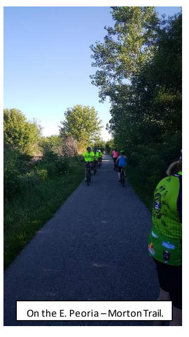
See more photos on I've Decided Facebook page https://www.facebook.com/ivedecidedpeoria