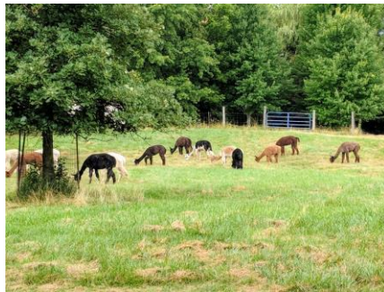
The Alpaca Farm Northwest of Princeton.