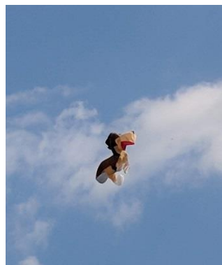
Someone took advantage of the strong wind to fly a dog kite.