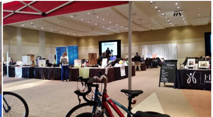
One of the speaker presenting during the conference.