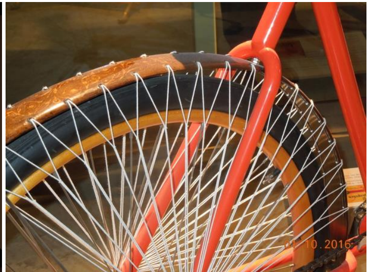
Wood rim & fender demonstrated fine craftsmanship by Patee Bike.