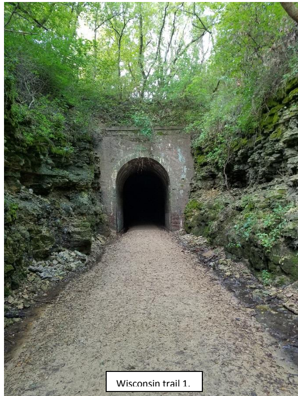
Wisconsin trail 1.