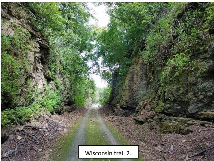
Wisconsin trail 2.