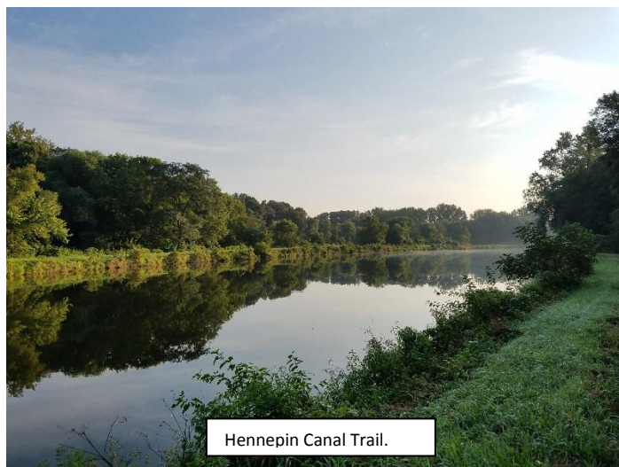
Hennepin Canal Trail.