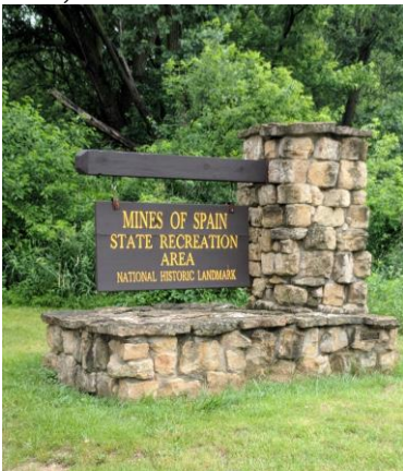
You can get a great panoramic view of the Mississippi from the top of here.