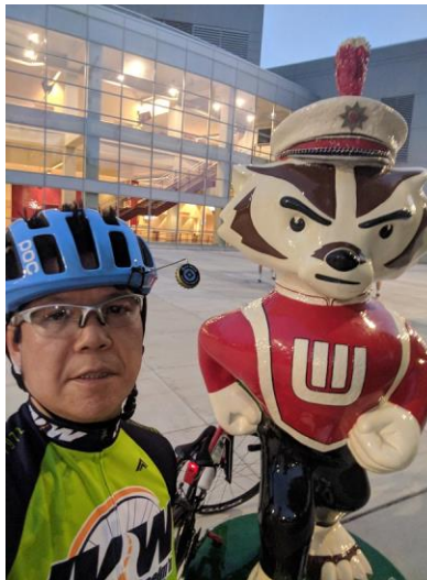
With Bucky the Badger, on the campus of U. of Wisconsin.

Did a recent bike tour with your IVW jersey some place warm? Send me a photo of you sporting the club kit (old or new) and a brief description of where it took place. We will include in the Monthly Note.