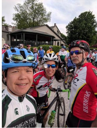
With Charlotte & Charley before the start of the Fondo.

early years before heading back to the winery for a post-ride meal. I love that this ride not only it offers great food and entertainment, but also donate a portion of the proceeds to Pedal the Cause, a cancer charity based in St. Louis. See route