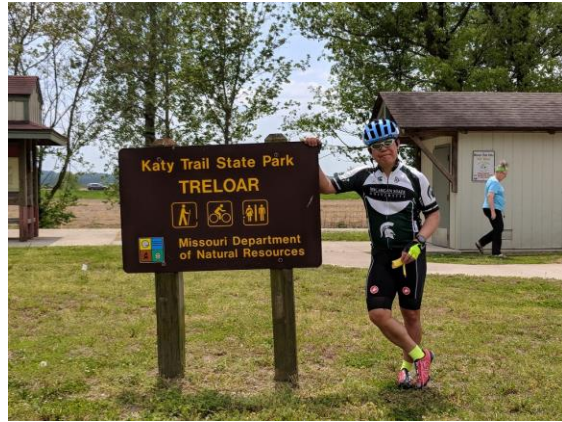
At the Katy Trail rest stop.