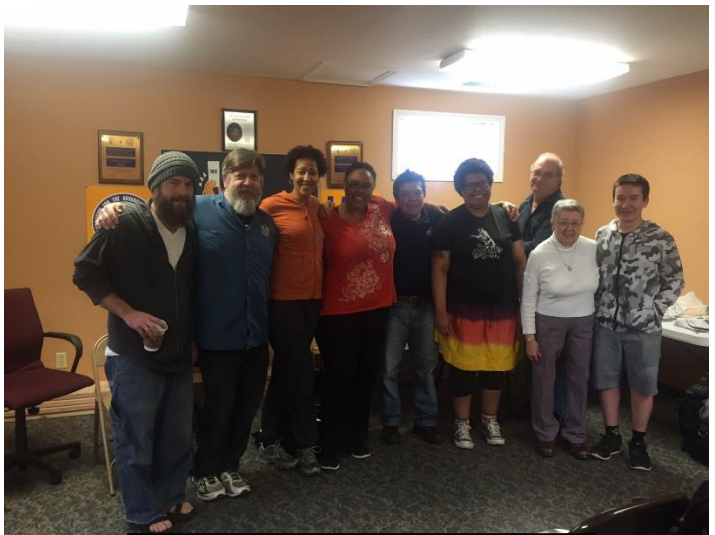
Photo op after the Meet and Greet session.