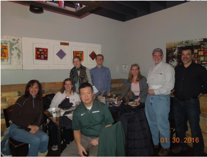
Some IVW members gathered for dinner prior to the movie.

A capacity crowd was on hand at the Apollo Theatre in Peoria on January 30 to watch the document film inspired to Ride. It’s the latest cycling film from the makers of Ride the Divide. The film followed a handful of cyclists from around the world as they race unsupported in the inaugural year (2015) of The Trans Am Bike Race. It’s the antithesis to events like Tour de France and Race Across America except there are no teams, no support vehicles, no special jerseys and no prize money involved. It was very well put together as the crew touch on several racers on an intimate level. It showed the true human spirit of competition even when Mother Nature tried to derail the race. I want to thank Peoria Area Mountain Bike Association (PAMBA) for sponsoring this film. If you missed the showing, I highly recommend you check it out on demand. https://vimeo.com/ondemand/inspiredtoride