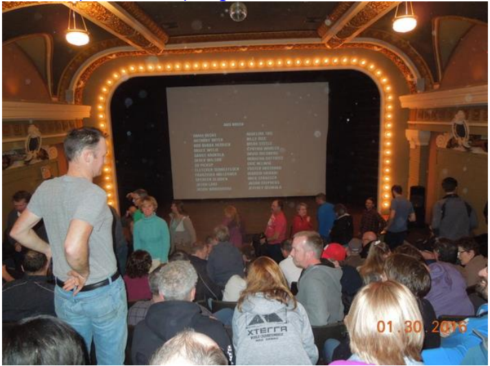
A full crowd at the Apollo Theatre fo the showing.