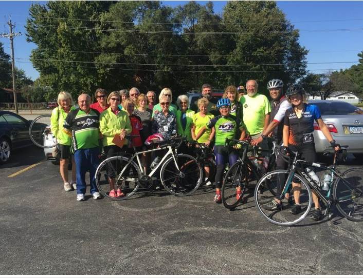
What other way to enjoy Saturday but to ride in the Quad Cities.