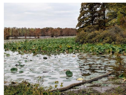
Lotus plants covering the swamp area of Horseshoe Lake.