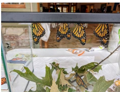
Monarch Butterflies at the Cache Wetlands