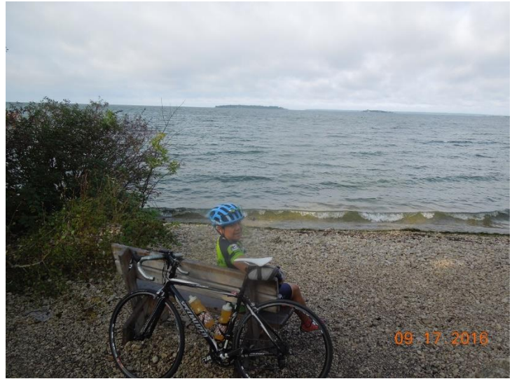
Yours truly taking in the view just south of Ephraim, WI.

Share your bike adventures – Participate in a memorable bike tour recently or planning to partake one soon? Send me your stories or photos of your adventures and share it with the club for next edition of the IVW Monthly Note.