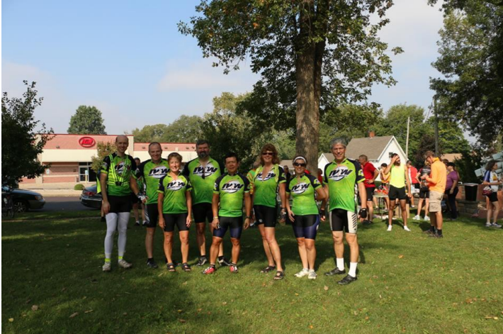
The Meet-In-The-Middle Ride in Mackinaw.