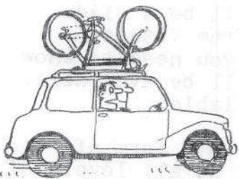
"IF THIS PETROL CRISIS GETS ANY WORSE I MIGHT HAVE TO GIVE UP CYCLING."

There was a IVW special planning meeting helded 24 Jan 80. The discussion at the meeting was constructive and many individuals have taken steps to implement the different ideas presented at the meeting. We hope the interest expressed will be the beginning of a good year of cycling activities for the Illinois Valley Wheelmen.