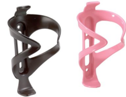
Bontrager Race Lite Cages