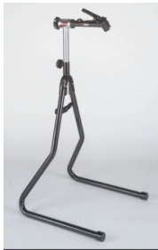
Wrench Force Repair Stand