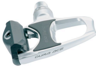
Shimano Dura-Ace Pedals