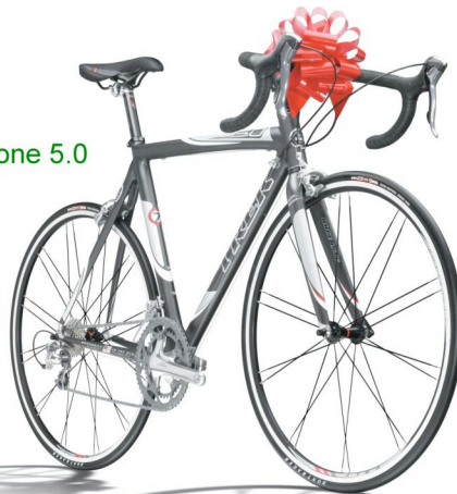
Trek Madone 5.0

Visit our Website for more Gift Ideas and download our entire sales flyer!