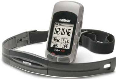
Garmin Edge 305 with HRM

We Have Computers and Electronics from Under $30!