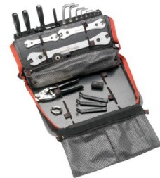
Wrench Force Deluxe Tool Kit