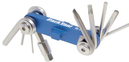
Park IB-2C Mini Tool