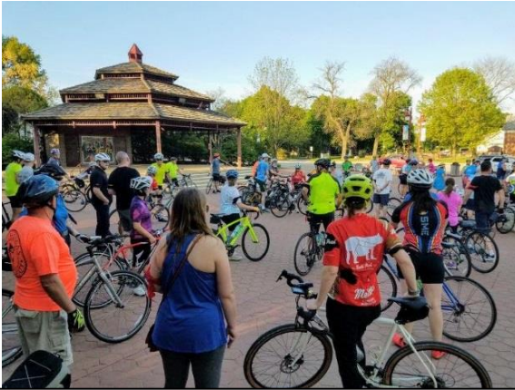
Riders waiting for the ROS speech giving by Bike Peoria.

Last month we participated in ride of silence. This is to honor those injured or killed cycling. It was once again at Tower Park in the Heights. We had around 80 join us to participate. We drew lots of attention from the drivers as we went by. There were several cheers and horns honked. All in all bike Peoria and the Peoria Heights police did a great job.