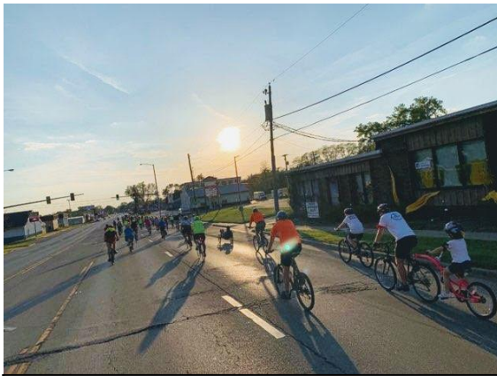
The group heading west on War Memorial Drive.