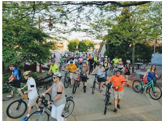
Back to the beginning, Tower Park.