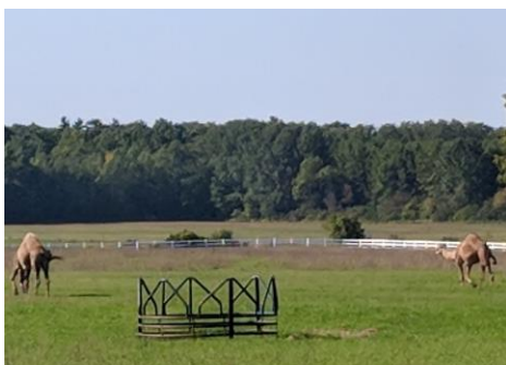
Camels roaming the field at the camel farm.