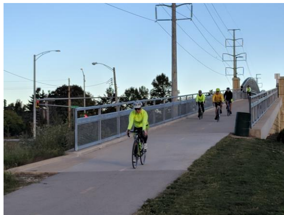
Riders arriving at the Junction City Shopping Center stop.