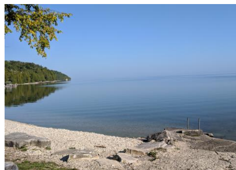
A calm morning up by Gills Rock beachfront.