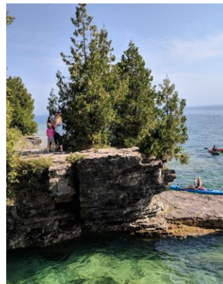
A couple of people launching their kayaks at the bottom.